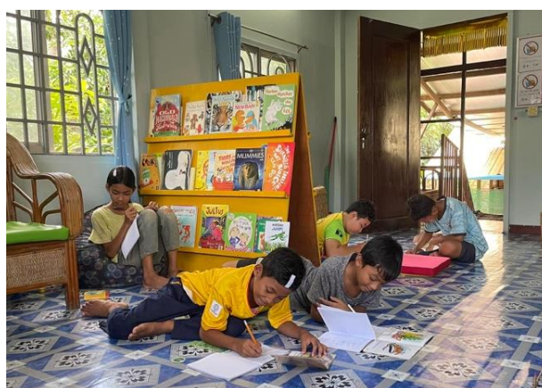
Kids enjoying the new library

The walls were freshly painted, new bookshelves, flooring, beanbags and seating were purchased. The children now enjoy a bigger space with a range of Khmer and English books suitable for their reading levels and culture. Library lessons are included as part of the weekly schedule.