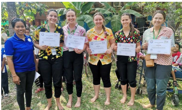
Students from James Cook University