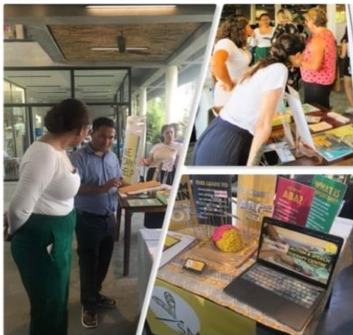
Special needs expo in Phnom Penh