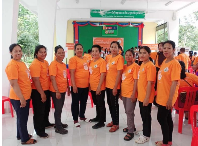
Staff attending the Women's Resource Centre workshop

Staff and carers working with the special needs students attended a workshop in November run by Women's Resource Centre. This was part of the 16-day campaign ending violence against women and girls under the theme "UNITE".