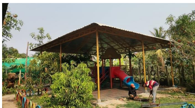
The new roof over the playground

Two very important and well used areas of the school are the playground and the football field. Unfortunately, the weather is often either too hot or too wet for outdoor play and games lessons on a Friday. Thanks to a generous donation, both areas are now covered and shaded.