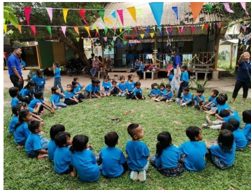
New T shirts for all the students!

New t-shirts were also provided to all students as part of an anonymous donor.